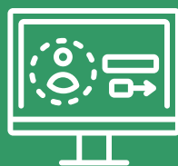
Figure out what club is the right fit for you. We encourage you to shop around to determine the club you want to be part of. Contact the club leader to confirm their next meeting date, location and time.