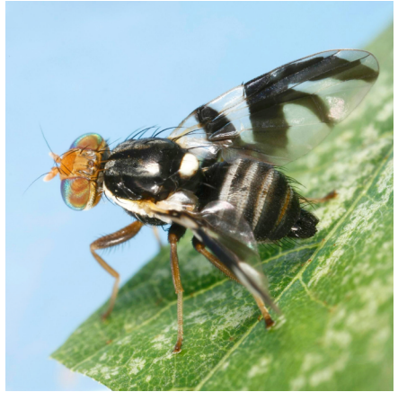
FIGURE 1. Apple maggot adult.

Predominantly a pest of apples, apple maggot will also infest pears, apricots, peaches, cherries, crabapples, and wild rose hips.