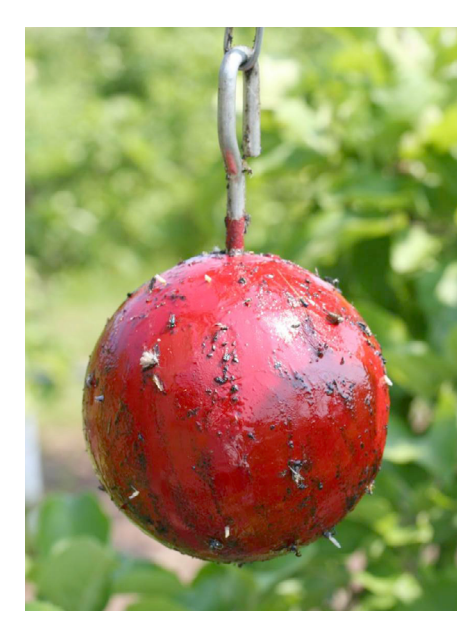
FIGURE 5. Red sticky sphere used for monitoring apple maggot (attractant bait not shown).

Red sphere traps can be purchased, made by hand from wood or plastic, or made by hanging a store-bought apple covered in a sticky substance (e.g., TangleFoot<sup>TM</sup>).