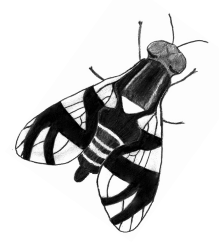
FIGURE 2. Apple maggot distinguishing features.

Predominantly a pest of apples, apple maggot will also infest pears, apricots, peaches, cherries, crabapples, and wild rose hips.