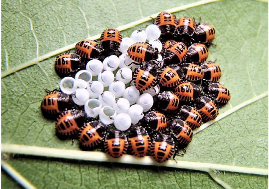
FIGURE 2. Newly hatched first instar BMSB nymphs.

A degree day model allows more accurate prediction of BMSB life events based on temperature rather than calendar date. Degree days for BMSB can be calculated using a base 50°F model. Because BMSB adults begin to move out of their overwintering sites when day length reaches 13.5 hours (approximately late April in Wisconsin), this can be used as a biofix for when to begin to accumulate degree days. From that time, it will take approximately 148 degree days for adults to reach sexual maturity and begin laying eggs.