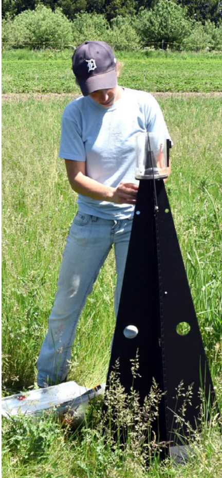
FIGURE 4. Monitoring for BMSB with a black pyramid trap.