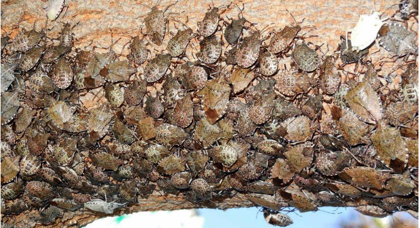
FIGURE 5. BMSB aggregation.

covers when plants are in bloom to allow pollinators access to the flowers. To help protect bushes and trees, apply a sticky substance to the trunk to capture nymphs and some adults as they climb from the ground into the canopy, although some adults may fly directly to the canopy. Bagging fruit can protect apples and other susceptible crops.