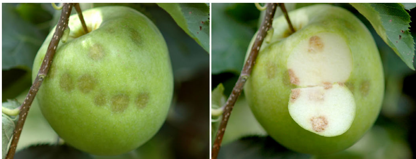
FIGURE 3. BMSB injury to apple fruit before and after peeling.

Another cultural control method, effective only to a limited degree, is the use of a trap crop or overwintering trap. In a trap crop, a highly desirable food source such as soy is provided on the edges of a crop. Then the trap crop is destroyed, hopefully eliminating a large portion of the BMSB population. For an overwintering trap, a box packed with straw or paper attracts BMSB adults looking for a warm place to overwinter. They can then be removed and destroyed before spring. These methods only work at low BMSB population densities and are not sustainable, long-term solutions.