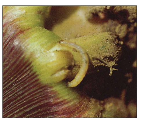
Corn rootworm larva