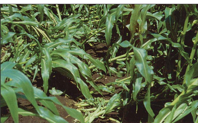
Lodged corn plants resulting from corn rootworm damage.

slopes. Hilltops tend to be a lessfavored egg-laying site.