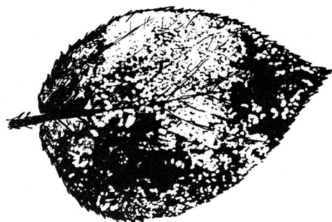
Rose leaf skeletonized by adult chafers.

If the insect is present, acephate, bifenthrin, carbaryl, cyfluthrin, deltamethrin, imidacloprid, lambda-cyhalothrin, and permethrin are effective chemical controls. For large populations, or to protect valuable