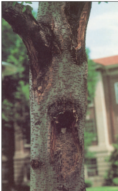
Three distinct cankers appear as sunken, depressed areas on the trunk of this honeylocust.

Until the early 1980s, honeylocusts appeared remarkably free of pathogenic diseases. However, an increasing number of honeylocust trees in Wisconsin and adjoining states have developed severe cankers.