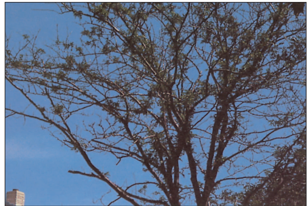
Canker disease frequently kills tree branches, but the tree may survive for several years.