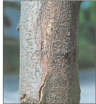
On this tree, the crack separates part of the healthy wood from the canker; the diseased bark extends upward on the side, and is only slightly sunken.

Cankers are usually oval to elongate. Trees frequently have several cankers. The bark sometimes splits between diseased and healthy tissue. Some cankers remain within the resulting crack in the bark, but others continue growing outward beyond the crack.