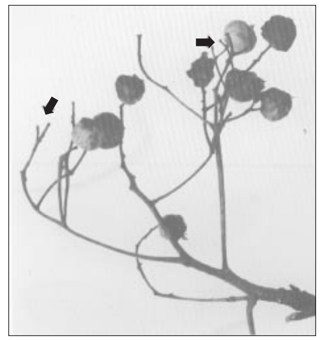
Fruits of this cluster failed to develop properly. They are black and shrivelled and many have fallen off because of scab disease.

While several chemicals are registered and effective for scab control on flowering crab, trials have not been conducted on fungicidal control of scab on mountain ash. However, these chemicals probably would control the disease on mountain ash. Fungo and Cleary 3336 are registered for use on mountain ash. Begin treatment at bud break. Make two to three additional applications at 10- to 14-day intervals. Strive for good coverage and apply the fungicide at times when the foliage can dry completely before the next rain occurs.