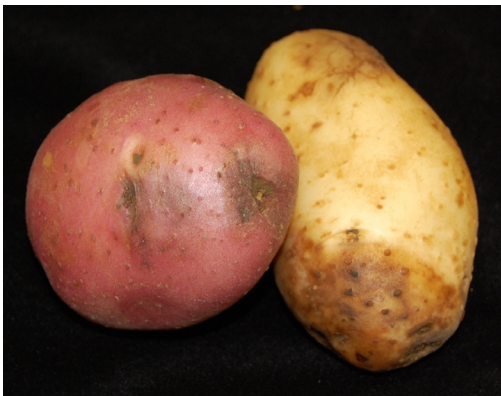
External potato tuber symptoms of late blight on red- and white-skinned varieties. Note the dark brown, bruised appearance.

Internal potato tuber symptoms of late blight. Note that areas are rust to dark brown in color and remain firm and grainy in texture. When symptoms progress, secondary soft-rotting pathogens often invade.