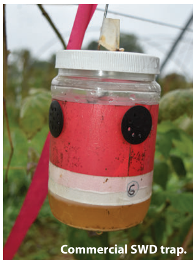
Commercial SWD trap.

Chemical controls for SWD are only partially effective and work best when combined with intensive monitoring and cultural controls such as sanitation and timely harvesting. To preserve and protect pollinators, avoid insecticide spray applications during bloom or when bees are active. If you need to apply an insecticide when bees are present, it is recommended to spray in the evening when bees are not actively flying.