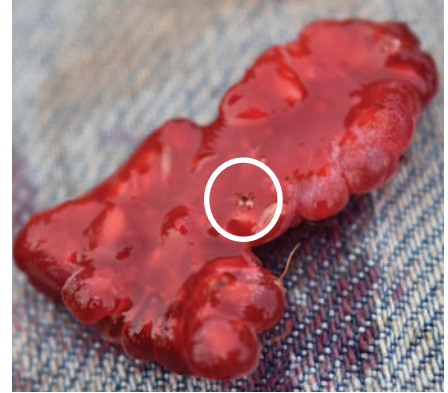
Larval SWD in a raspberry.

At optimal temperatures (68 to 77°F), SWD can complete a generation in 8 to 12 days. Populations build up very quickly given this rapid generational turnover, providing only a short time span from first detection to economically significant damage. For this reason, monitoring and implementation of immediate control measures at the first sign of adult activity is critical.