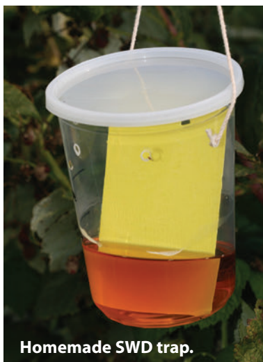
Homemade SWD trap.