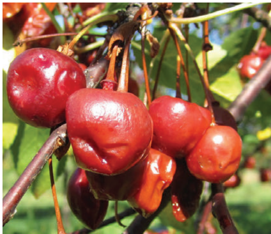
SWD damage to cherries.

Unlike other drosophilid flies that rely on damaged or rotten fruit to lay eggs (oviposit), SWD females have a distinctly hardened, serrated egg-laying structure called a sclerotized ovipositor. The sclerotized ovipositor allows adult females to cut a slit into the skin of healthy, intact fruit. Crop damage occurs as the eggs and larvae develop inside the fruit.