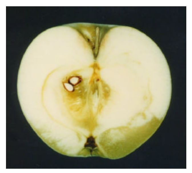
Typical watercore, not limited to the core.

to develop watercore than shaded apples. Large apples from young trees develop watercore more frequently than do apples from mature trees. Excessive thinning or partial cropping because of frost losses increases the potential for watercore. Fruit calcium is also important in watercore development. Apples with sufficient calcium are less prone to watercore than those with low calcium. This observation is consistent